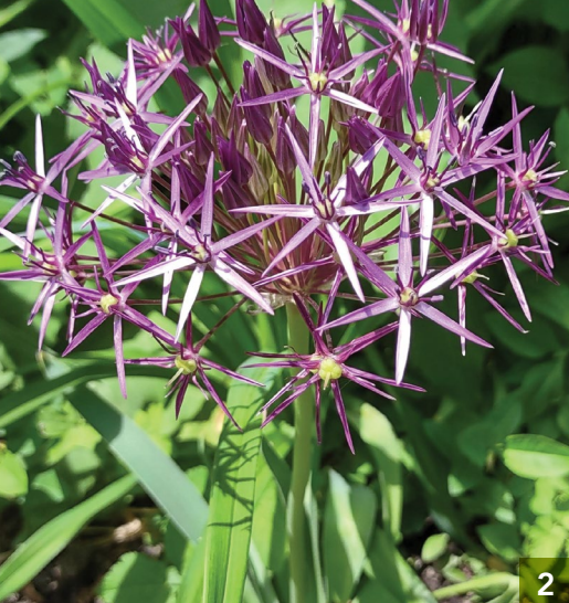
Blooming Brookwood (1) Double Peony, (2) Star of Persia, (3) Allium canadense