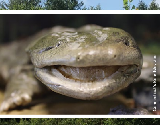
Giant eastern hellbender is generally nocturnal and crawls along silt-free stream floors. They emerge at night to hunt.

The Upper Susquehanna Coalition (USC), a non-profit that works in a multi-county region in NYS and Pennsylvania to enable wetland, floodplain, streambank and stream protection and improvements, contributed significant time, expertise, and funding to enable OLT to pursue and complete this