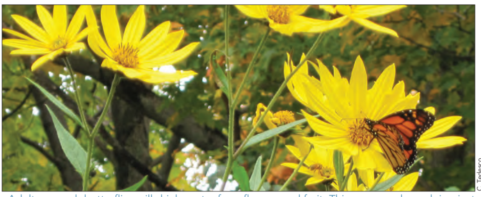
Adult monarch butterflies will drink nectar from flowers and fruit. This one seen here doing just that at Brookwood Point.