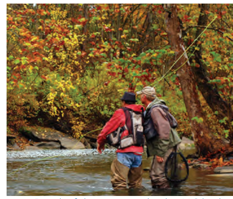
Popular fishing spot under the 11C bridge south of Cooperstown now has fishing access at OLT's Compton Bridge Conservation Area.

The lands OLT currently owns and protects form the Blueway. Blueway lands provide public access for fishing, hiking, paddling, bird watching, and educational