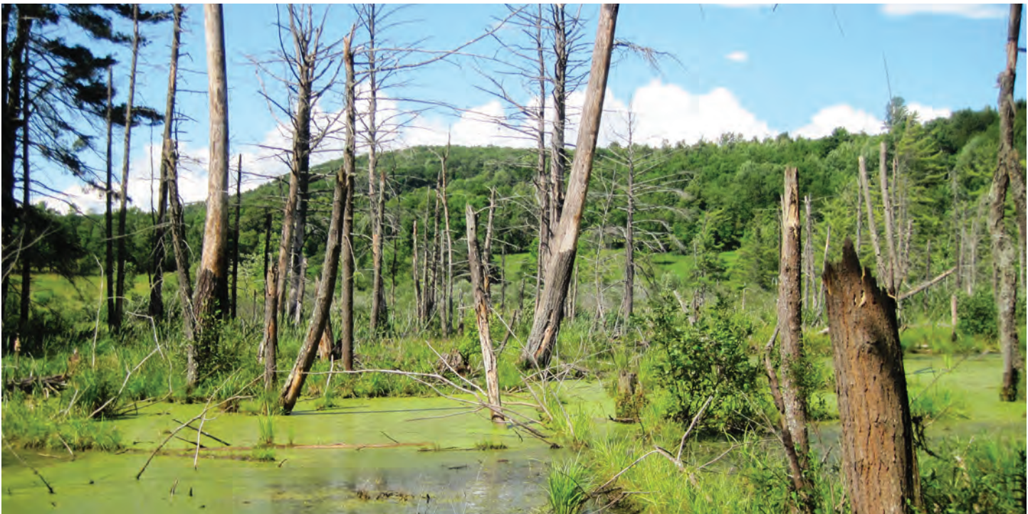
Over 20 acres of wetlands natural areas on the LaDine/Monnelly easement acts as an important natural filter for Oaks Creek.