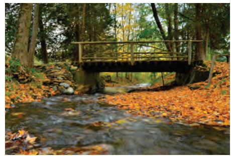
Money from the Scenic Byway Grant will repair this bridge at Brookwood Point.

With each falling and twirling maple seed helicopter, we count the days closer to laying the garden to sleep for the long winter ahead.