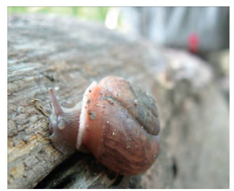
All Things Small in Nature

beauty in our own backyard and highlights the importance of conserving it for the future."