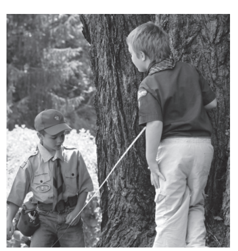
Cub Scouts measure mammoth white pine

Several descendants of the area's founding families attended, recalling their early days growing up in Dimmock Hollow. Cub Scout Pack 3 from Morris also participated, led by Beth Child. After the walk, many enjoyed dinner at the Empire House in Gilbertsville which featured a menu of locally produced food as well as Butternut Valley goat cheese to sample along with New York State wines.